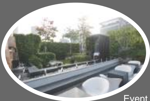
Event Sky Garden